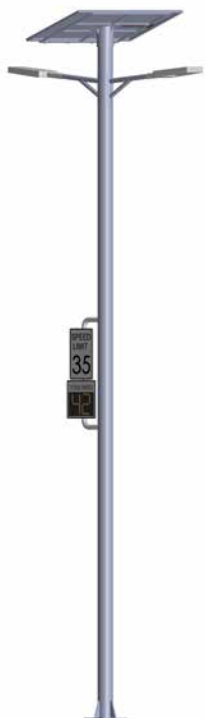
Traffic control Billboard access